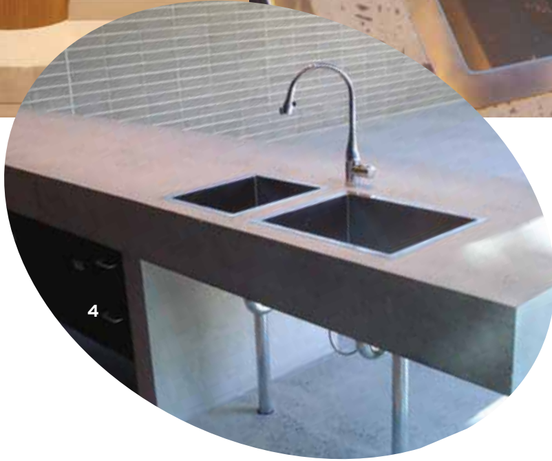
1. Corian® benchtop - Design: Ikal Kitchens. 2. Corian® benchtop - Design: Ultra Space. 3. and 4. Concrete benchtop - Stoneart Aust.